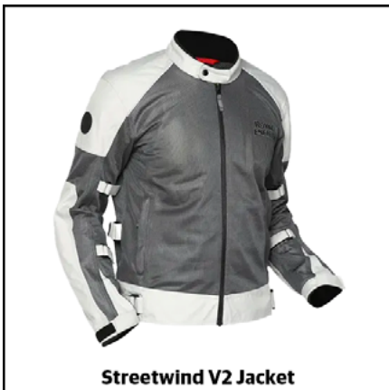
Streetwind V2 Jacket

Scram Mode Kit: Part Number Reference Guide