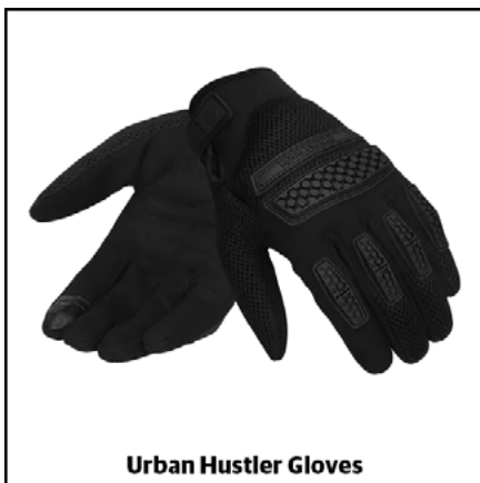
Urban Hustler Gloves